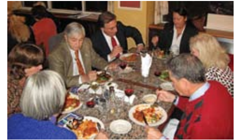
Everyone enjoyed the evening as evidenced by all the smiles.