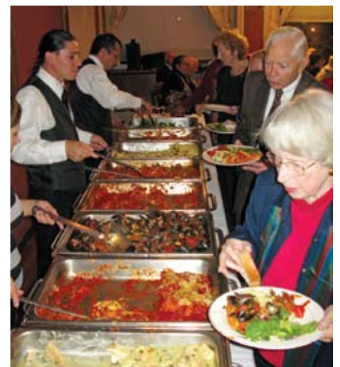
A delicious Italian style repast was served up at the Harbor Restaurant.